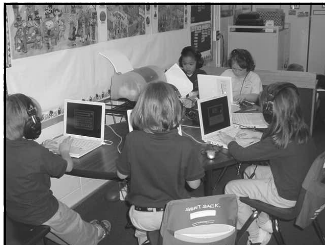
Second graders are creating electronic jeopardy games to practice Social Studies skills.