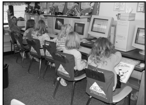
Essential Component #14: Students have frequent and equitable access to computers.