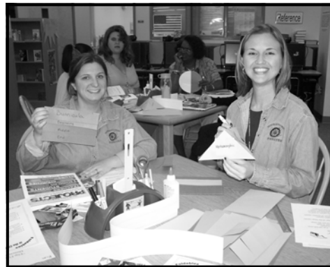
Osceola County, FL teachers enjoying the “Foldables in a Box” workshop after school.