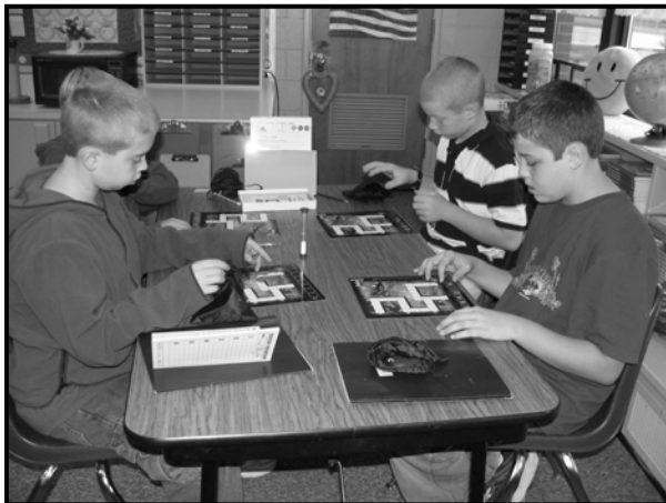
Essential Component #5: Students work at six diverse learning stations on a daily basis.