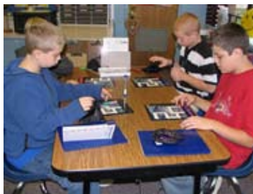
TEAMS classroom scene.

The plan is to begin with sixth grade and add seventh and eighth grades in the following years. Contact ISI for more information and fees for professional development.