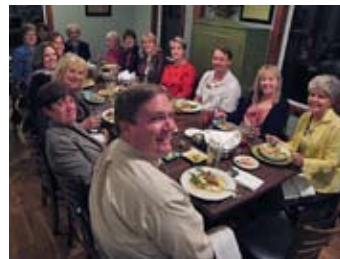
Okaloosa County leaders

These events are a tribute and thank you to leaders who step out of the box to embrace change and innovation during these difficult times. With budget cuts and high stakes testing, it's easy to fall back on the traditional and comfortable. ISI salutes education leaders who take on new challenges and find creative ways to solve problems. Doing more of the same has never worked to bring different results. These leaders understand that lesson and are offering alternative ways of learning through Project CHILD.