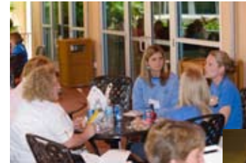
2008 Conference Memories