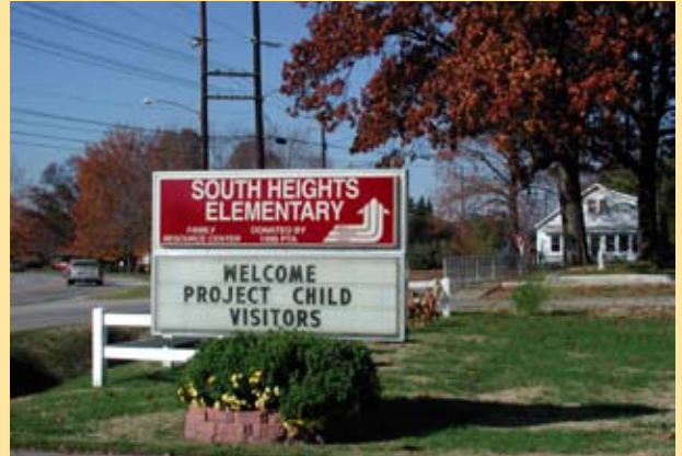
In 2004 South Heights won the National School Change Award.