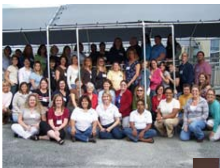
2008 CHILD Consultant Training Class