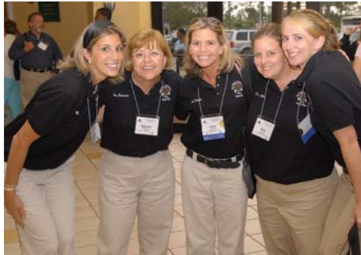
The CHILD team from Vero Beach Elementary showing their school pride at last year's conference.