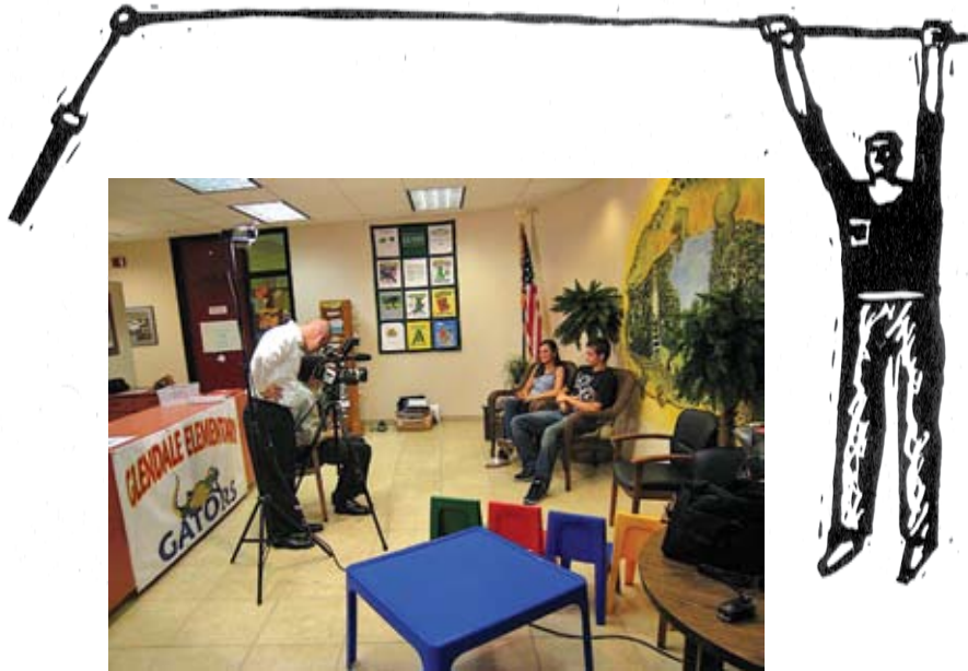
Filming the CHILD graduates.