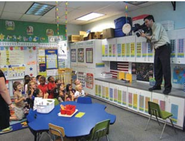
"We love Project CHILD!"