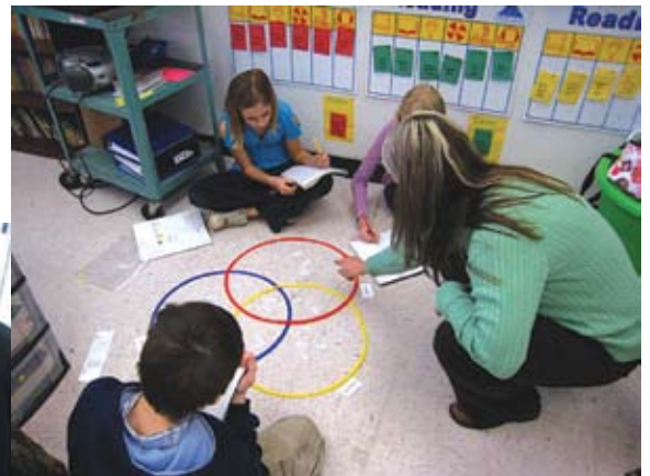
The ESE inclusion teacher works with students in the reading classroom.