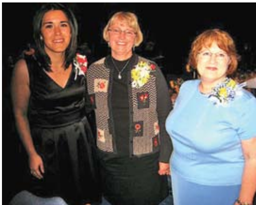
Another feather in Okaloosa's cap is that three of the county's Teacher of the Year honorees are Project CHILD teachers!