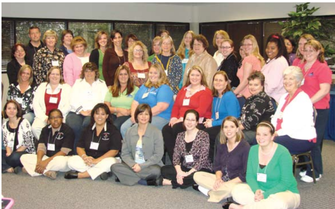
2009 Project CHILD Certified Consultants are eager to train new teachers.

We applaud the dedication and professionalism of these CHILD educators who gave up a weekend to learn how to mentor and coach new CHILD teachers next year. They are eager to get started, so contact ISI if you are ready to join the growing family of Project CHILD teachers.